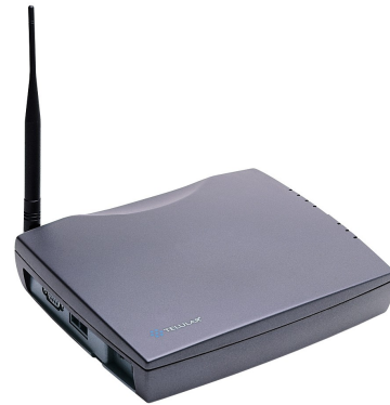
Phonecell® SX5 Series Basic Cellular Telephone Terminal

* Available only on participating cellular networks. Check with your cellular service provider for service and fees.