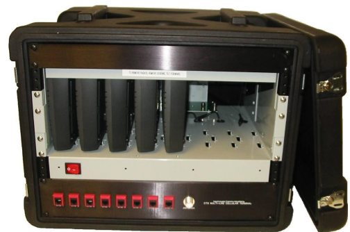
CT-8 Portable Multi-Line Cellular Telephone Terminal, shown with 5 of 8 lines installed

Models and kits are available for portable use, or for permanent installation in vehicles or buildings. Custom applications are possible. Call today to discuss your specific needs.