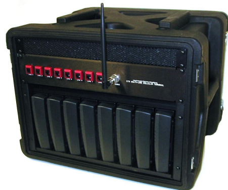
CT-8 Portable Multi-Line Cellular Telephone Terminal, shown with 8 of 8 lines installed

Models and kits are available for portable use, or for permanent installation in vehicles or buildings. Custom applications are possible. Call today to discuss your specific needs.